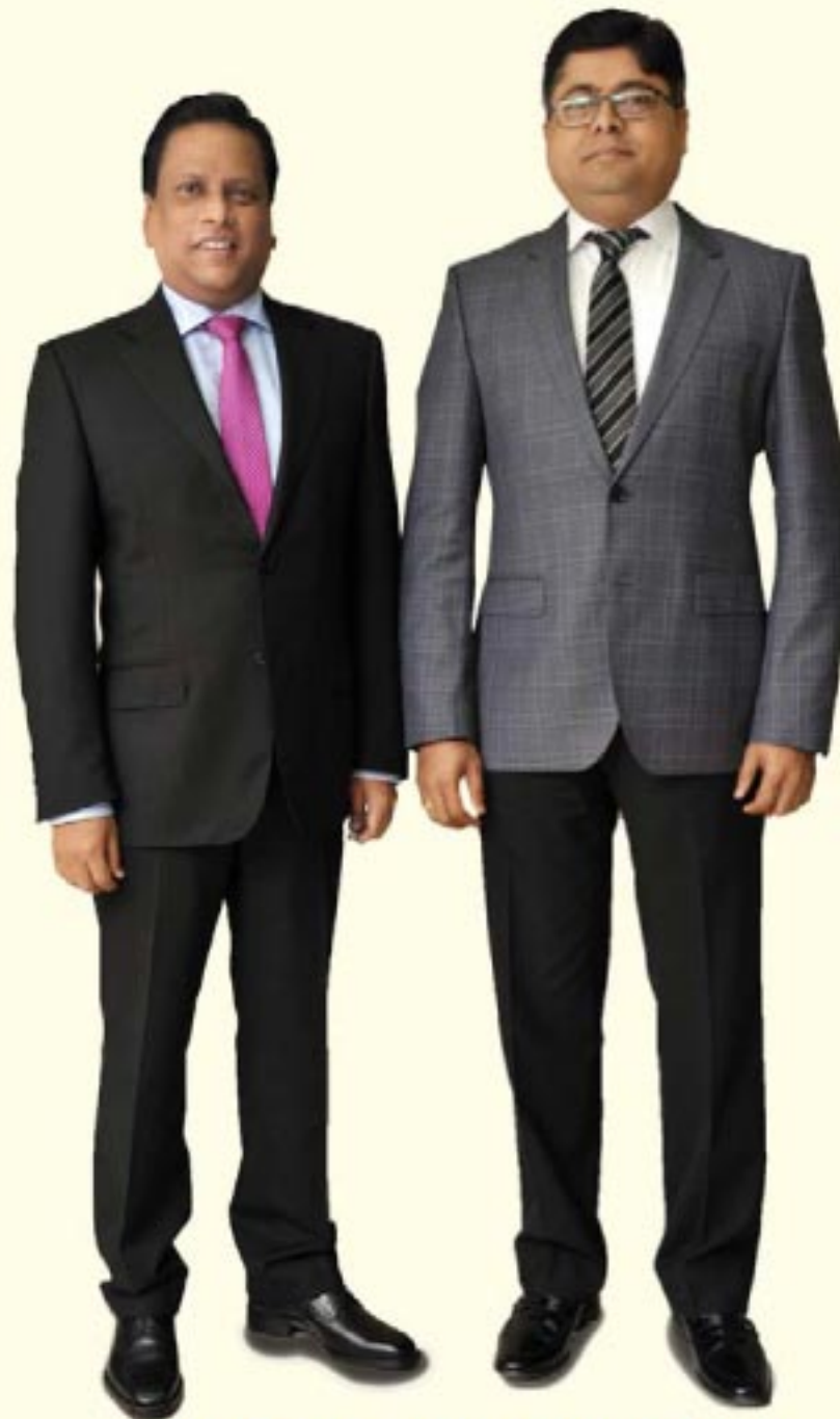
Hon'ble Chairman & Managing Director of Jamuna Bank