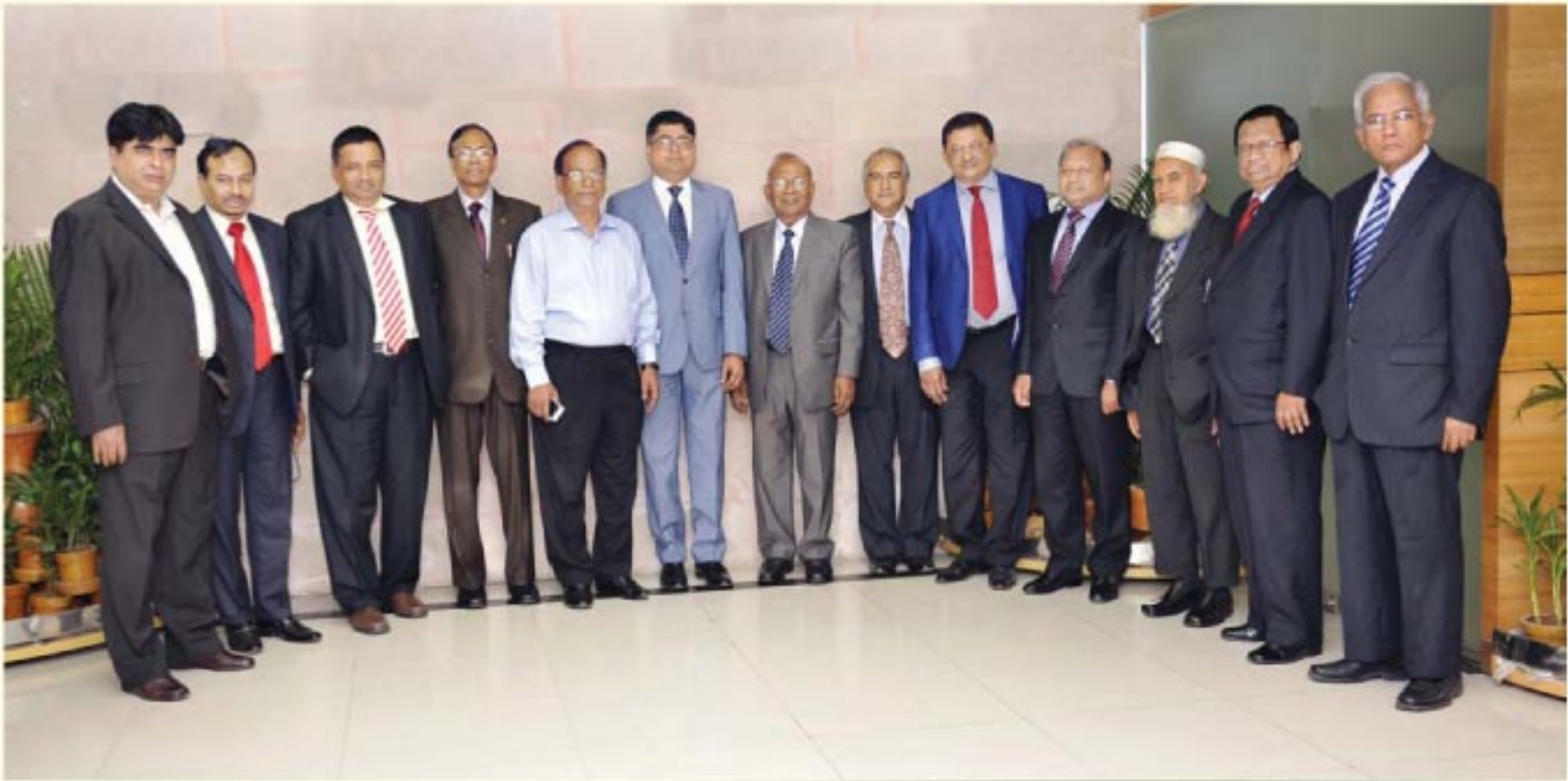
Honorable Directors of Jamuna Bank